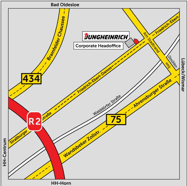
From Ring 2 to Friedrich-Ebert-Damm